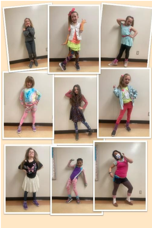
Some students from Mme. Ashley's class on their 80's day.